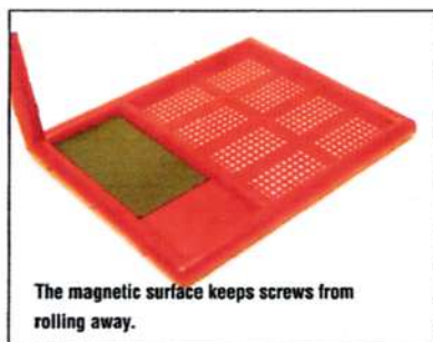
The magnetic surface keeps screws from rolling away.

It looks like a set of plastic parallel bars.