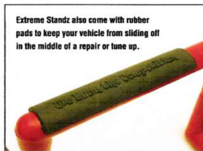
Extreme Standz also come with rubber pads to keep your vehicle from sliding off in the middle of a repair or tune up.